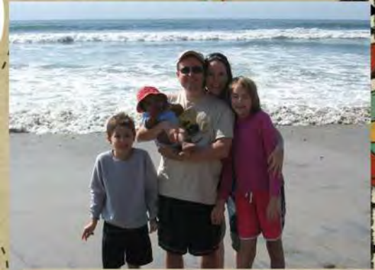
Our Beach Vacation