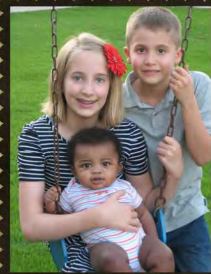
Swinging in our Backyard