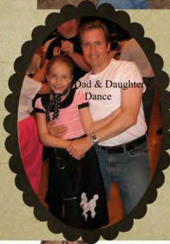
Dad & Daughter Dance