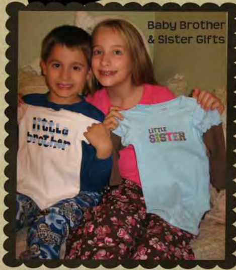
Baby Brother & Sister Gifts