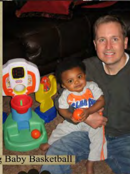
Playing Baby Basketball