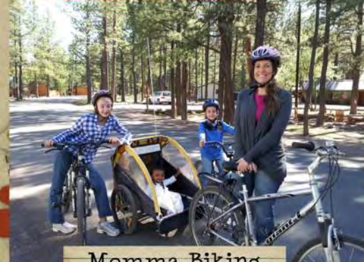
Momma Biking With Her Babies