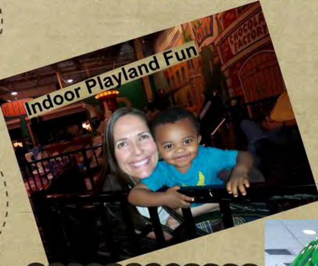
Indoor Playland Fun