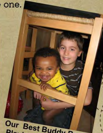
Our Best Buddy Boys Playing Hide & Seek