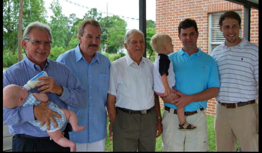
The guys on Walker's side of the family