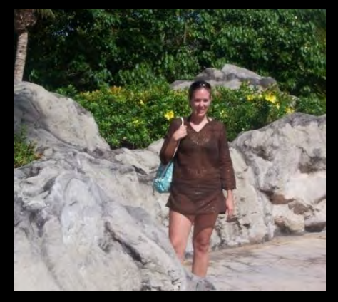
Touring the U.S. Virgin Islands