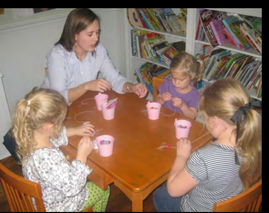
Girl time...making jewelry