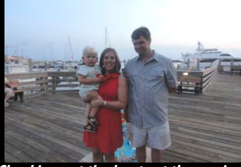
Checking out the boats at the marina