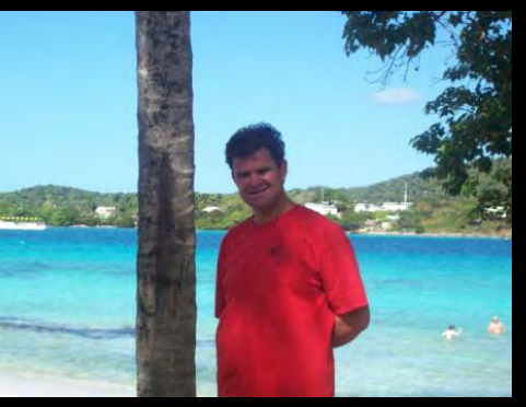
St. Thomas USVI