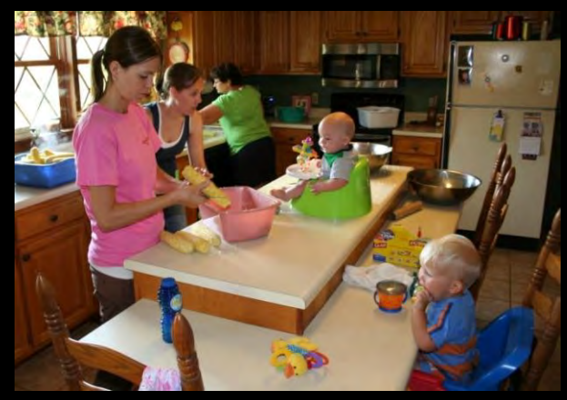
Putting up corn from the farm