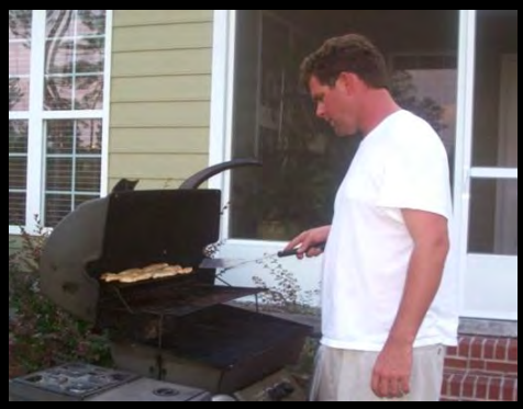
The "grill king"