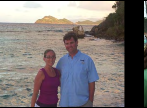
St. Thomas, USVI trip