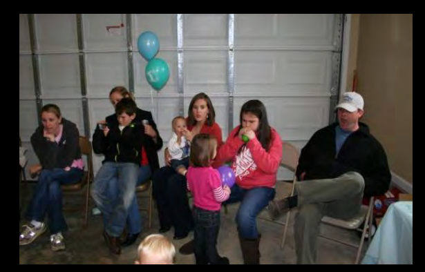
More b-day fun