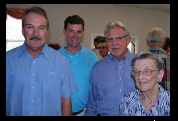
Celebrating Walker's grandparents 90th b-days