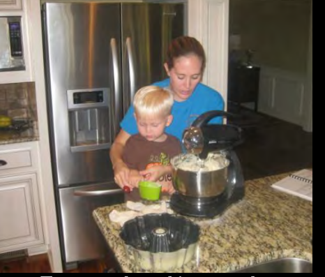
Teamwork making a cake