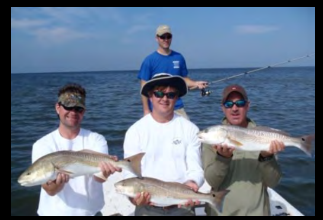
Walker's off coast fishing fun