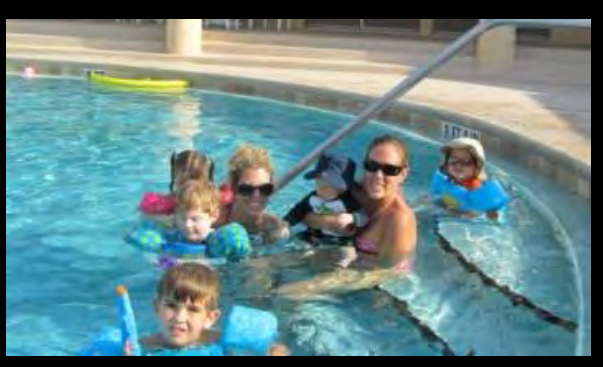
Pool fun at the beach with friends